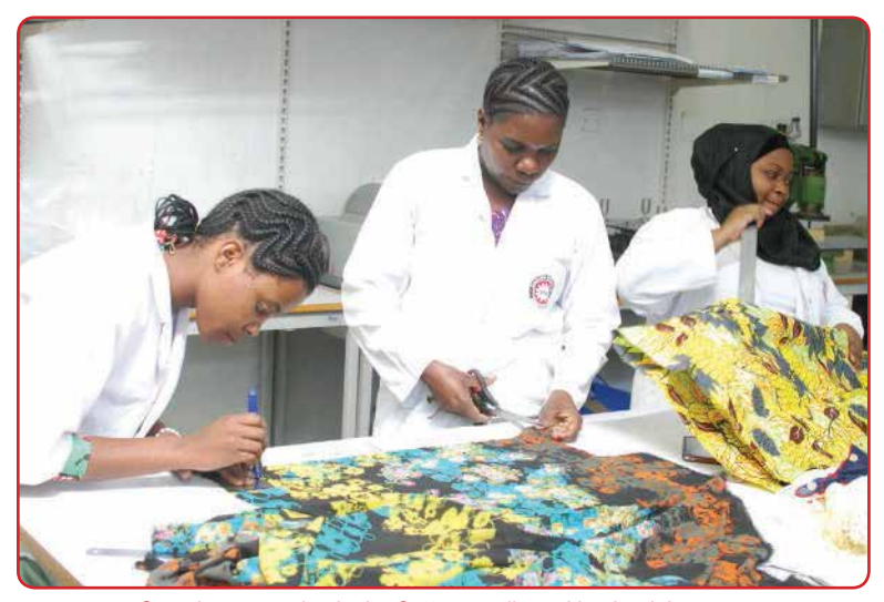
Sample preparation in the Cotton, textile and leather laboratory

Leather testing equipment includes the water vapour permeability tester, tensometer, permeometer, penetrometer, flexometer and shrinkage temperature apparatus. The leather testing equipment can test various types of leather including shoe upper, sole, garment and upholstery.