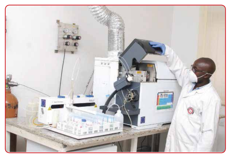
Sample analysis in the food chemistry laboratory

The laboratory also carries out analysis of wide range of food pathogens such as Salmonella, E.coli, Staphylococcus, Vibrios, Pseudomonas, Listeria, Enterococcus etc. Food laboratory is also EAC PT National coordinator for fruit juice and honey. Currently it provides Proficiency Testing for Honey in the area of HMF, acidity, water insoluble matter, ash content lead and zinc and Fruit juice in the area of pH, brix, acidity, vitamin C. Alcohol, Copper, lead, arsenic and Iron. This Laboratory is Accredited by SADCAS.