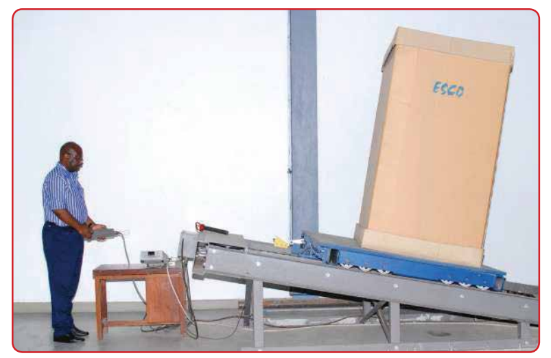
Testing of packaging materials in the Packaging Technology Centre

are developing national standards on packages and packaging materials, facilitation of imports and exports of the packaging materials against relevant standards and provision of information on packaging standards, requirements and technology.